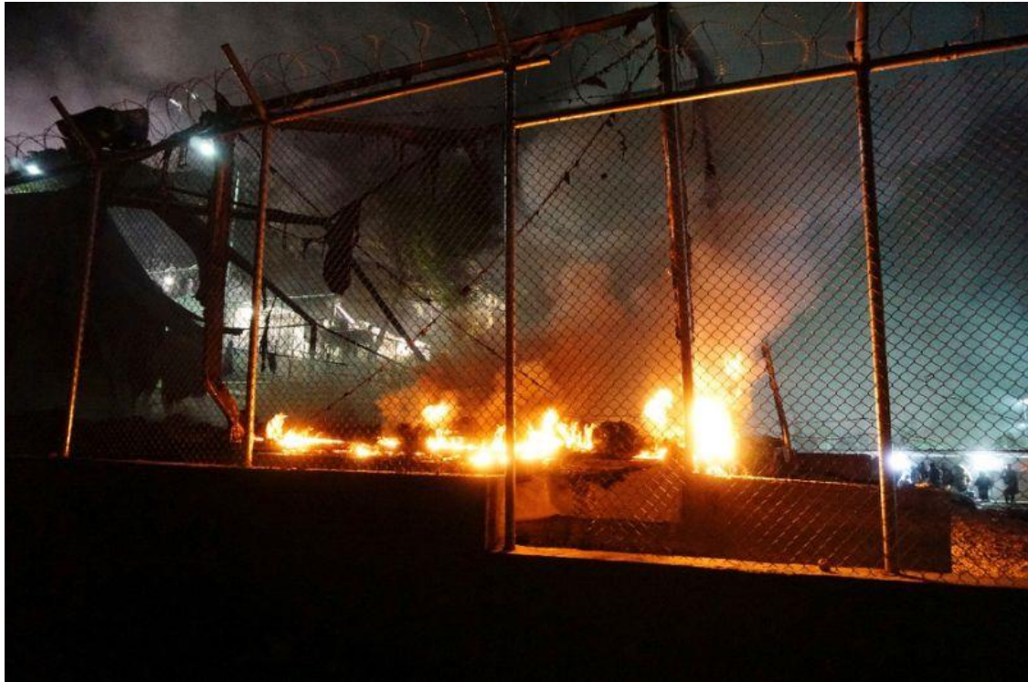
Migrants set fire to Greek detention center https://euobserver.com/justice/118313