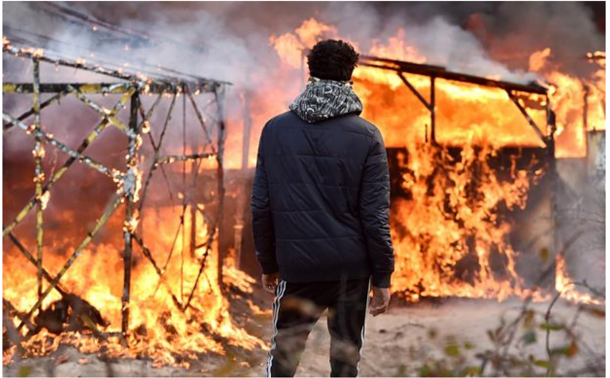
Migrants Set Camp on Fire in Greece, 6 Injured http://greece.greekreporter.com/2016/06...6-injured/