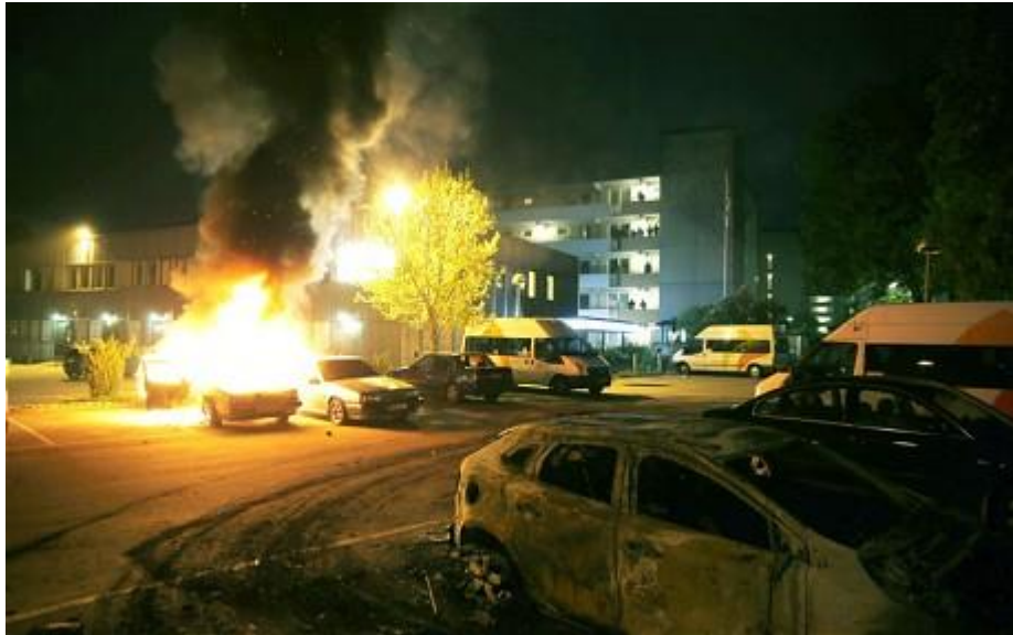
Stockholm riots leave Sweden's dreams of perfect society up in smoke http://www.telegraph.co.uk/news/worldne ... smoke.html