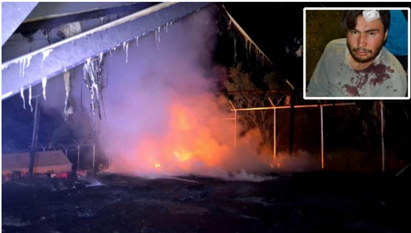
Migrants set fire to Greece camp http://newsinfo.inquirer.net/789455/mig...reece-camp