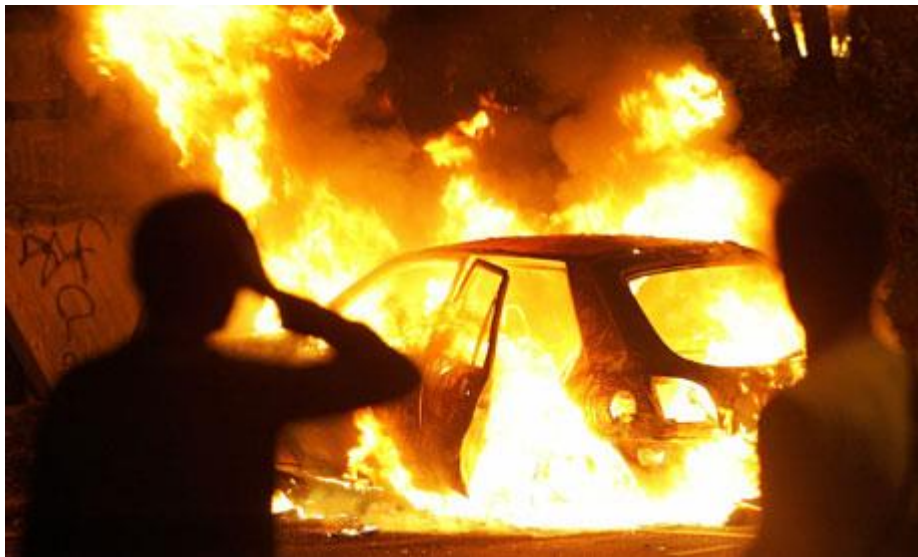
Paris bathed in flames.

Sweden, which is overwhelmed by migrants from the third world, like Britain and France, has exact same problem. The larger migrant populations have regular uprisings against the native White population.